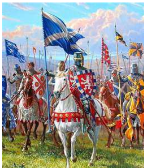
The Battle of Bannockburn (24 June 1314) was the decisive battle in the First War of Scottish Independence.